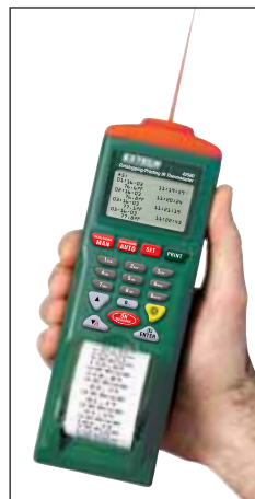
Convenient portable handheld size.